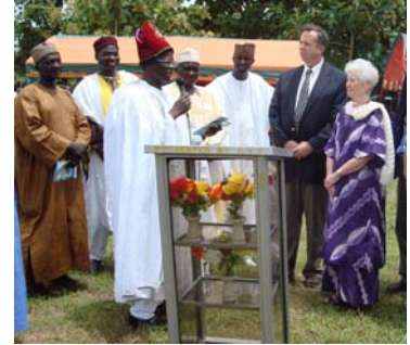
The Nigeria Dedication